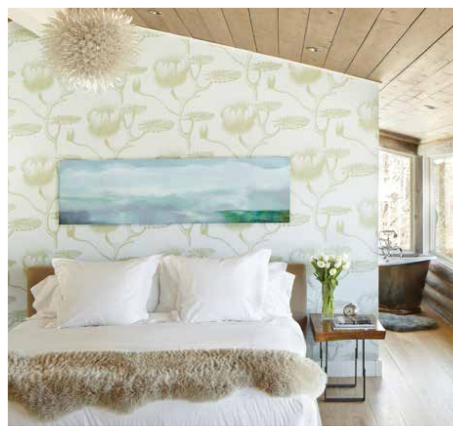
Opposite: The painting is Gregory Block's Night Cap from Gallery 1261 in Denver, Colorado. The chandelier is Bocci and the chairs are from Room & Board. This page, clockwise from top left: The staircase is anchored by a custom timber beam. The armchair is a Swedish antique, and the side table is from Room & Board. | A custom walnut island on wheels is topped with Carrara marble in a sleek kitchen; German pendant lights are from Plug Lighting. | Susan Schiesser's Ocean painting inspired the soothing palette in a cozy bedroom. Lily wallpaper is from Cole & Son, and the hanging light is from Plug Lighting.