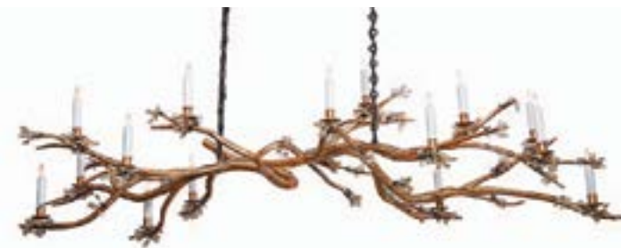
Bagatelle chandelier (pricing available to trade professionals), allan-knight.com

Visit cowboysindians.com for a complete list of resources.