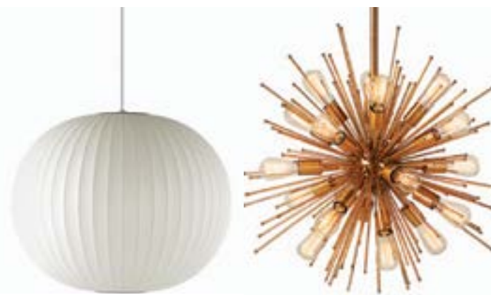
Nelson Ball Bubble pendant ($345), store.hermanmiller.com