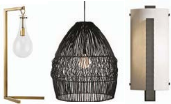
Sabine lamp ($600), arteriorshome.com

BRIGHTEN YOUR HOME WITH BULBS OF EVERY SHAPE AND SIZE.